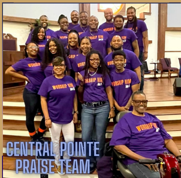
CENTRAL POINTE PRAISE TEAM